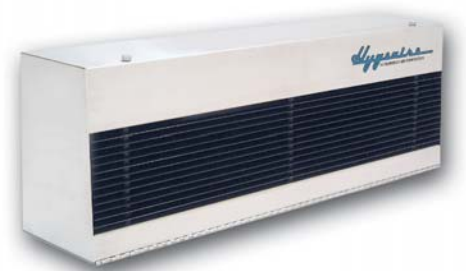
Hygosino ® Ultraviolet Air Disinfection Fixtures are manufactured by the Atlantic Ultraviolet Corp. Made in the USA