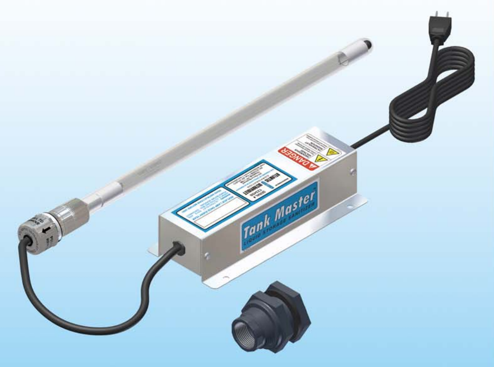
Tank Master™ are versatile ultraviolet germicidal disinfection fixtures for liquid storage tanks.